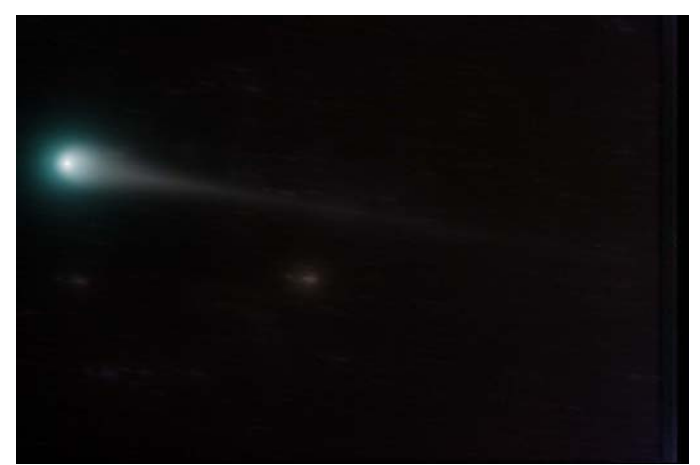
Comet Lulin , 28 February 2009 – 11 images stacked, 180 sec each, Imaged using a Takahashi E-180 and a Canon 20D, Chester, VT