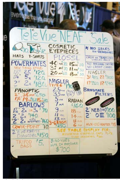
Televue had their "scratch and ding" sale this year.