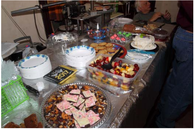
Another year, more desserts! *

Lots of food was enjoyed: turkey with stuffing, salmon, avocado with smoked salmon sushi, spanakopita, meatballs, couscous, Portuguese chorizo and pepper sandwiches, Greek salad, deviled eggs, antipasto, pizza, and more, with desserts such as Phil Levine's homemade chocolate chip cookies and his wife Linda Levine's homemade fudge, candy cane cookies, powdered sugar covered nut balls, chocolate log, cakes and cupcakes, pies, fruit salad, and more.