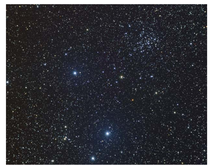
NGC 1528 (top right) and NGC 1545 (bottom left).

January 2017 Courtesy LVAS Observer's Challenge*** NGC 1545 – Open Cluster in Perseus Magnitude 6.2; Size 12'