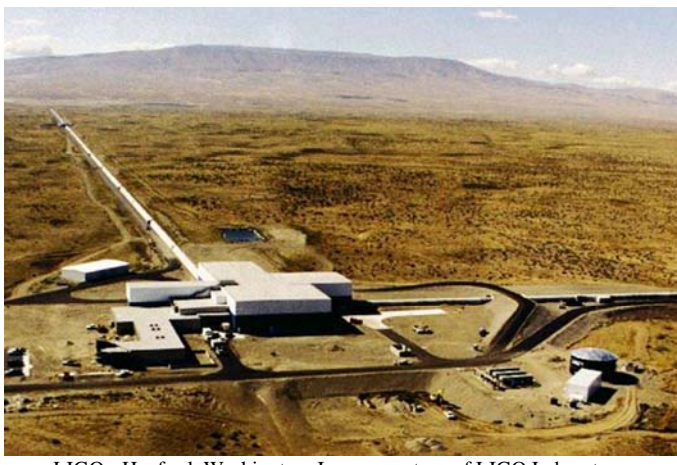
LIGO - Hanford, Washington.

Parking at the CfA is allowed for the duration of the meeting