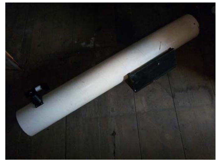
A47. Homemade Reflector. 150 mm, f/8

Editor: Images in this article by Bernie Kosicki.