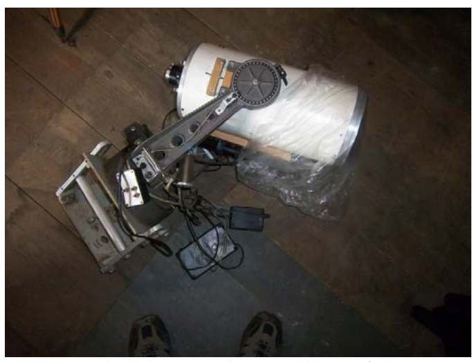
A13. Celestron Maksutov. 200 mm, f/10