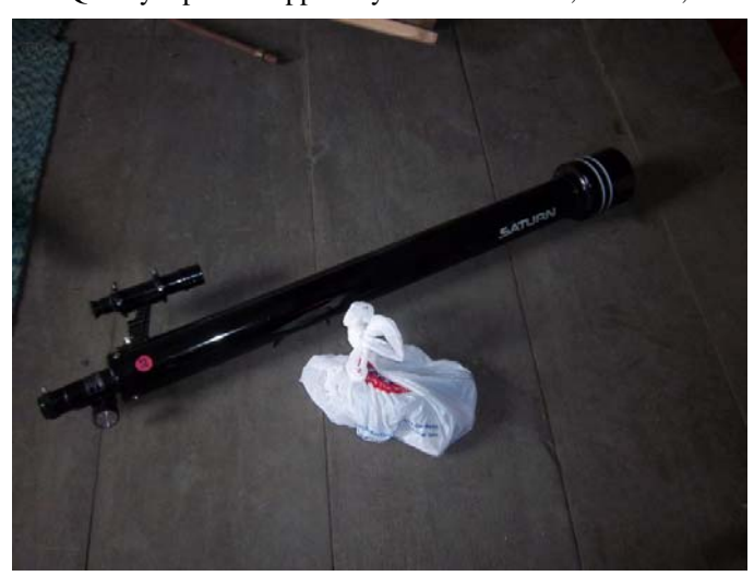
A25. Saturn Refractor. 60 mm, f/15